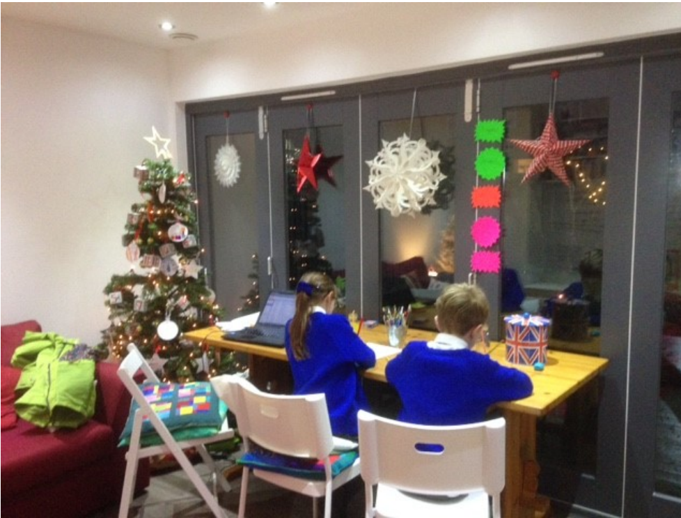
Hard at work in the Christmassy School Room.