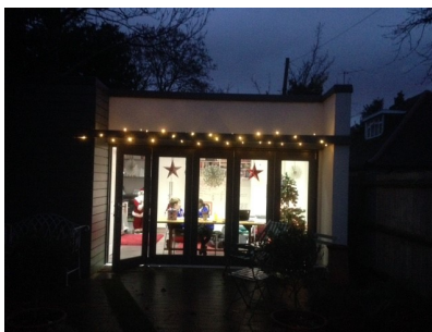
The School Room Teddington looking oh so festive!

Now all that remains for me to do is to wish you all a relaxed and restful Christmas and a Happy New Year. I look forward to seeing you all again in 2017.